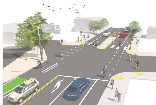
82 nd Ave. Rendering by Jake Marshall, ASLA

The Foster Road Streetscape Project will deliver a street that is safer and more attractive for people walking, biking, taking transit and driving. With improved crossings and other safety features, modern signals, new pavement, 190 street trees and new decorative street lights, the project will transform Foster Road into an inviting thoroughfare that supports a vibrant commercial district and enhances the quality of life in the surrounding neighborhoods.