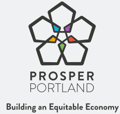
Primary Logo + Tagline