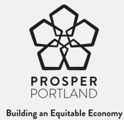
Primary Logo Black + Tagline