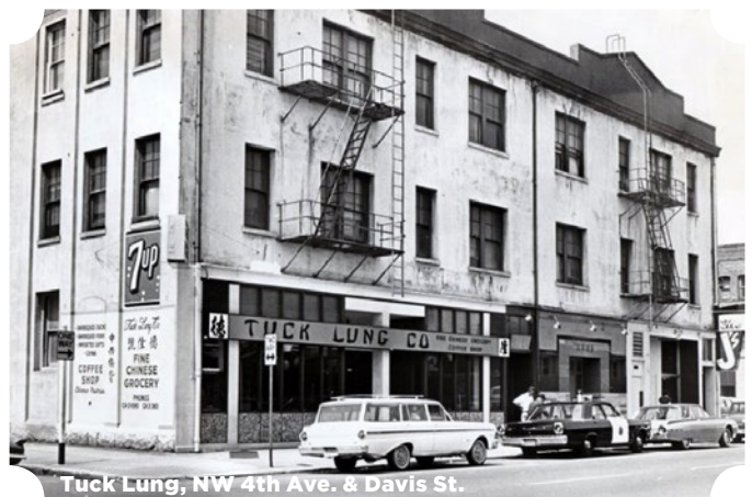
Tuck Lung, NW 4th Ave. & Davis St.