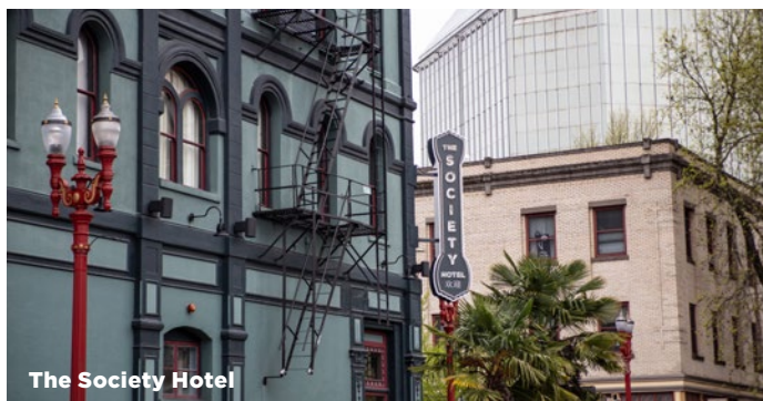
The Society Hotel