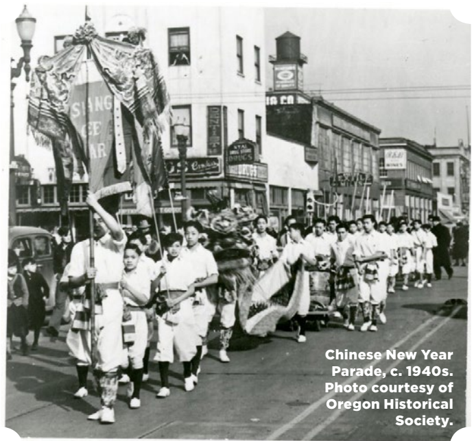
Chinese New Year Parade, c. 1940s.

Recent developments have brought increased activity and richness into Old Town, with more in the planning stages. Old Town is rapidly becoming a more exciting neighborhood for residents, visitors, shoppers, and workers.