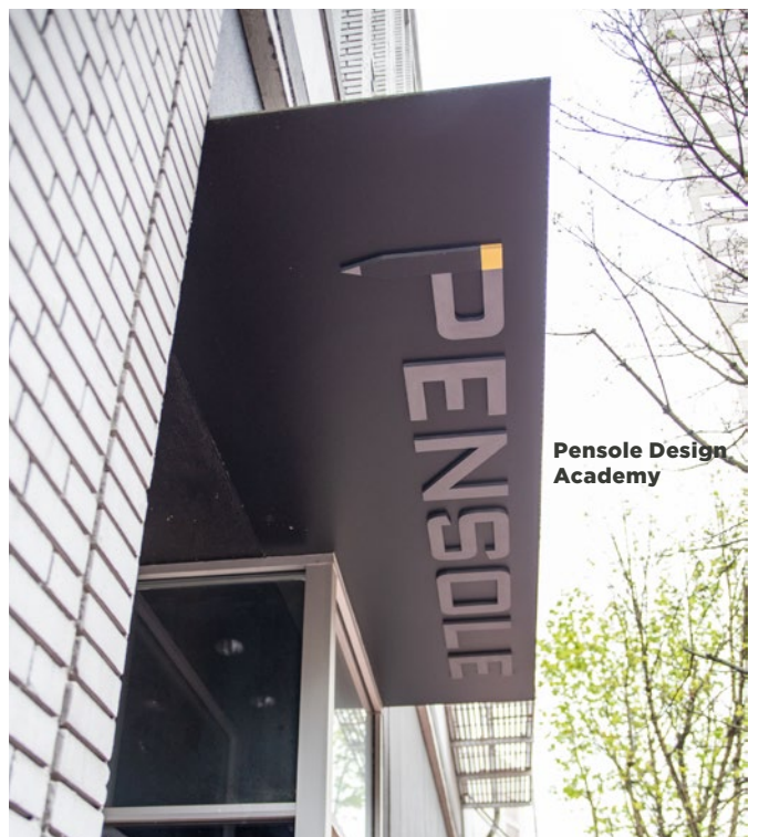
Pensole Design Academy