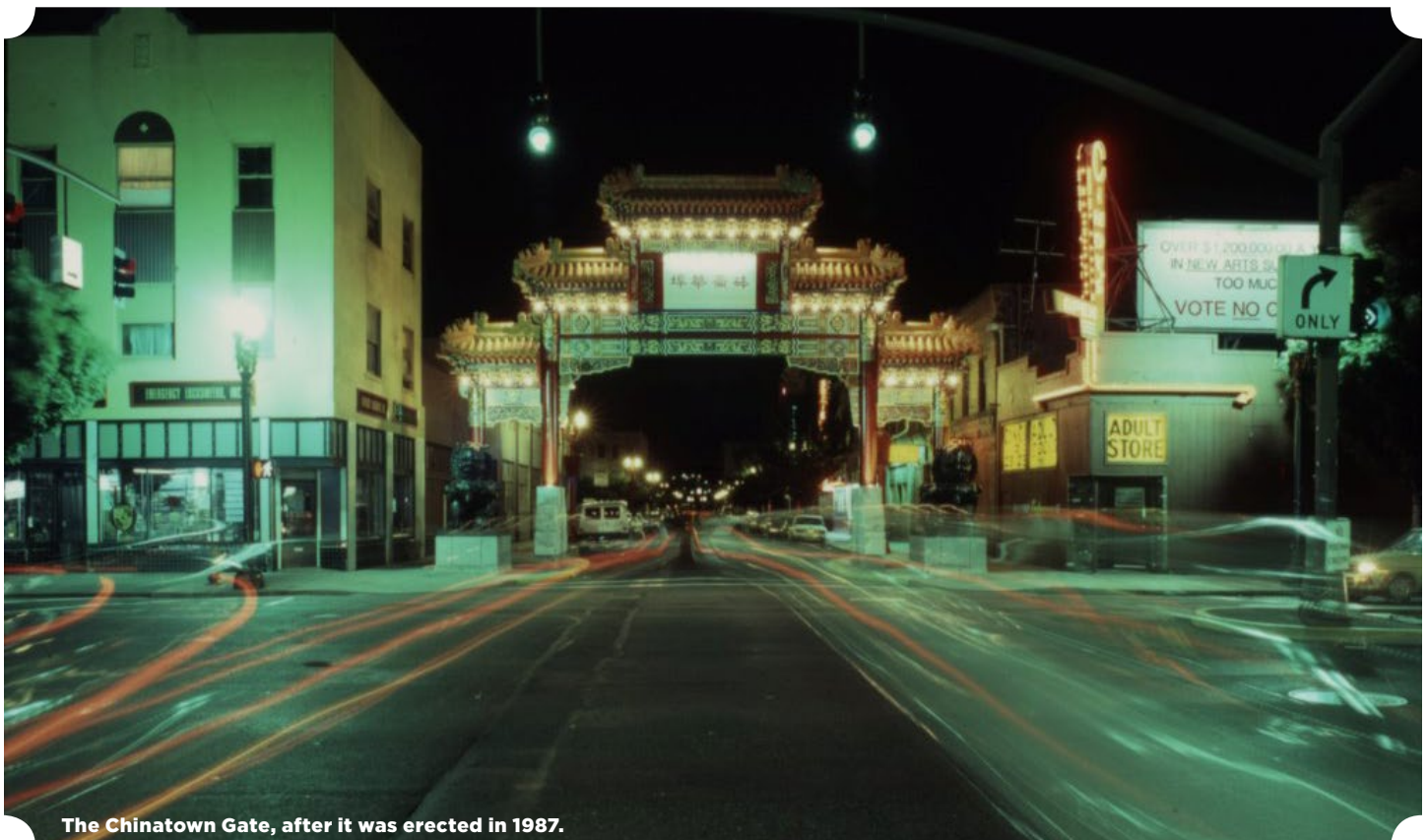
The Chinatown Gate, after it was erected in 1987.

Prosper Portland expects the developer selected through this RFP (Developer) to negotiate a Memorandum of Understanding (MOU) with Prosper Portland for the project. The MOU will generally define roles, responsibilities, contingencies, and commitments of the Developer and Prosper Portland. Upon successful negotiation, Prosper Portland and the Developer may enter into a Purchase and Sale Agreement (PSA), Disposition and Development Agreement (DDA), or other agreement outlining in detail the terms and conditions of the redevelopment of the Property.