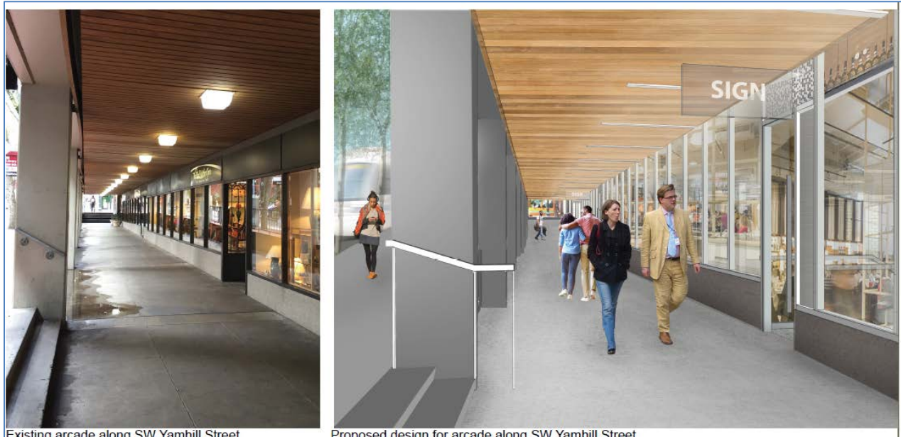
Existing arcade along SW Yamhill Street.