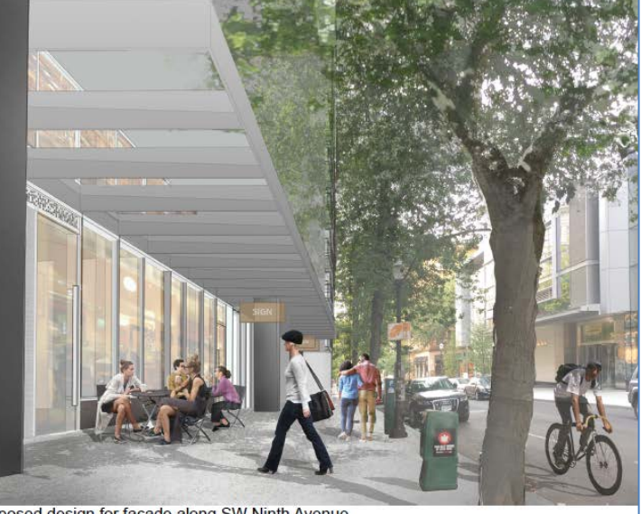
Proposed design for facade along SW Ninth Avenue. DESIGN ELEMENTS