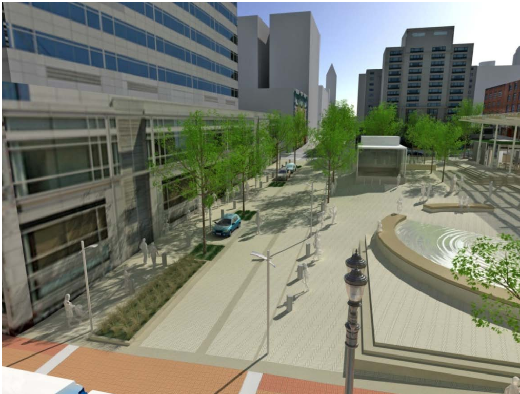
Director Park and Enhanced Streetscapes, View of SW Park Avenue enhanced streetscapes looking south