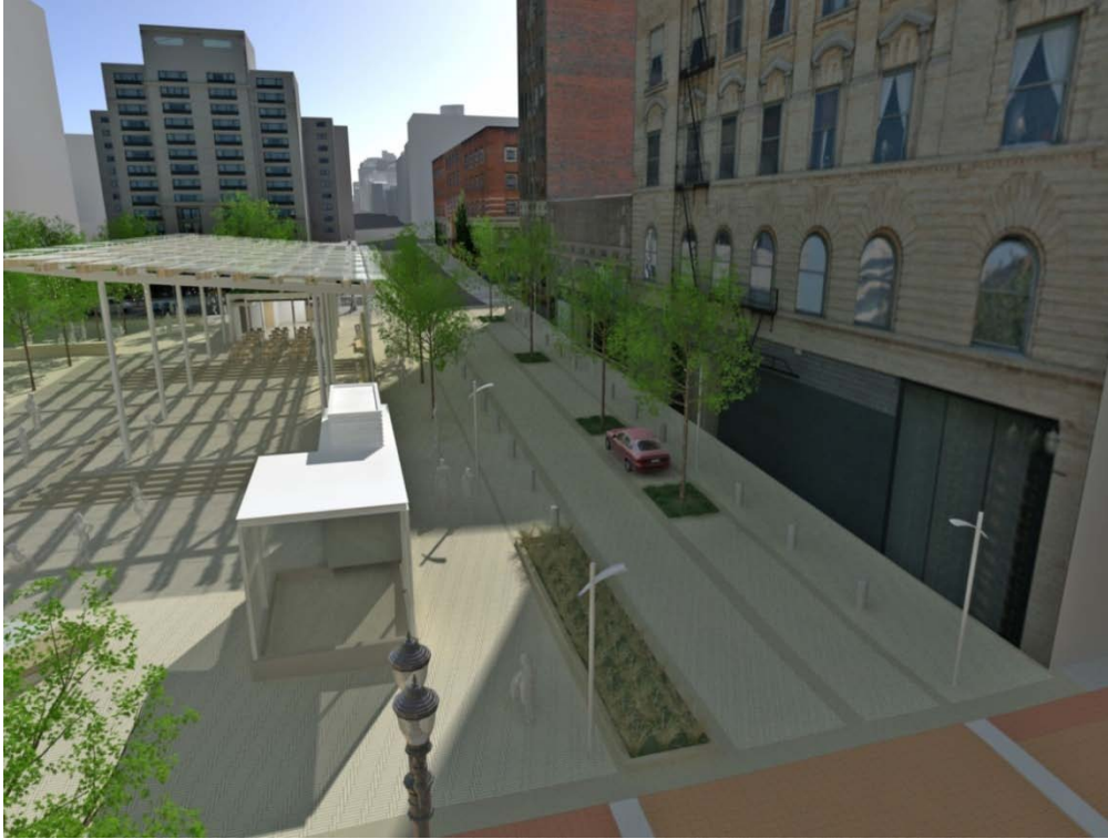
Director Park and Enhanced Streetscapes, View of SW 9 th Avenue enhanced streetscapes looking south