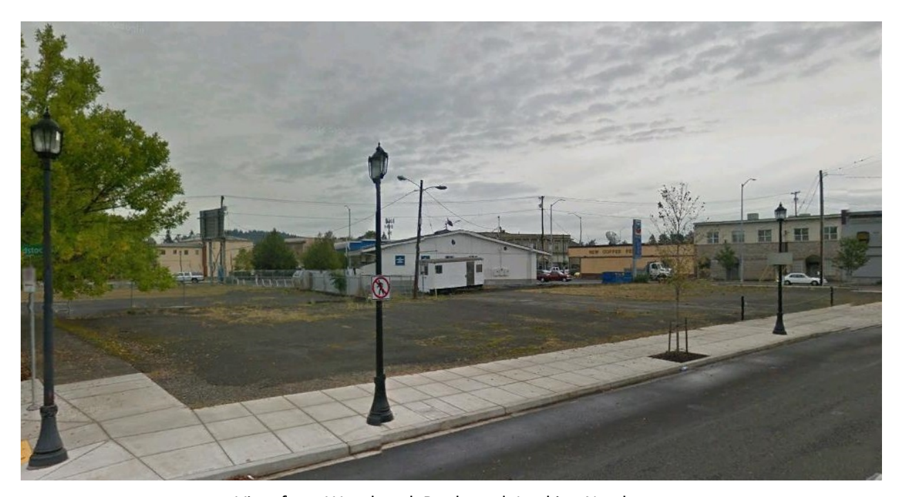
View from Woodstock Boulevard, Looking Northeast