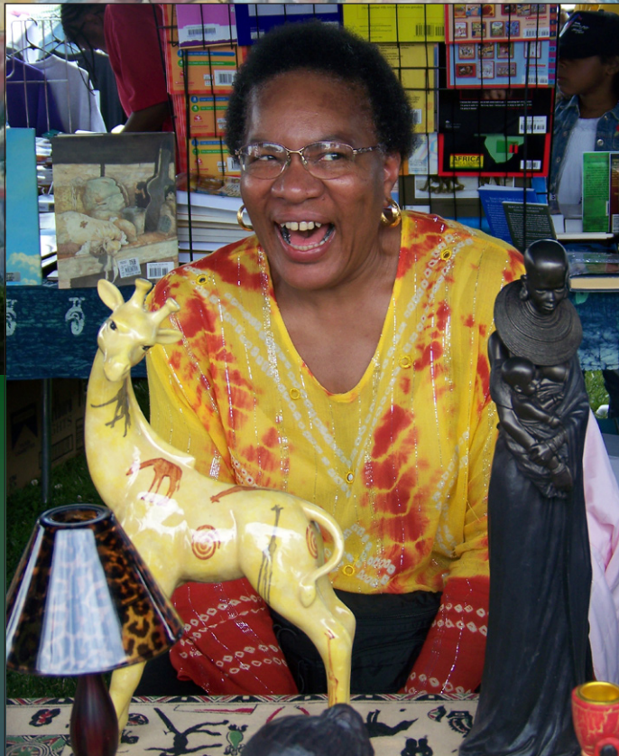
Good in the Neighborhood 2007