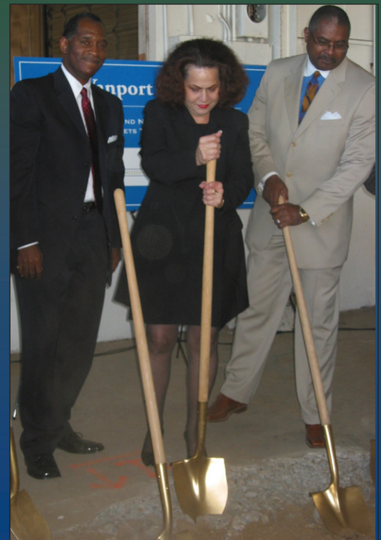
Groundbreaking for Vanport Development