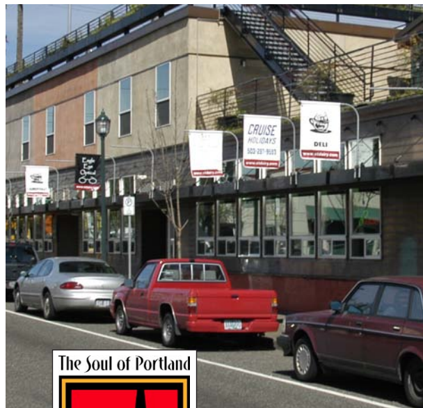
NE Martin Luther King, Jr. Blvd. and Russel Street

The NE MLK-EDS gave participants opportunities to identify strengths and weaknesses of NE MLK Boulevard's business and social/cultural environments, public services and physical appearance. They were also able to identify where they most often purchase goods and services – along the boulevard or elsewhere in the Portland metropolitan area – and what kinds of new businesses they would most like to see locate on the boulevard. Finally, they were asked what strategies and incentives they would support to attract new development.