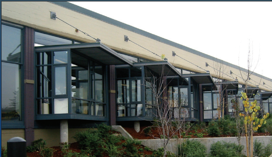
Henry V - Green Building