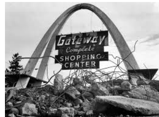
Historic photos of the Gateway Fred Meyer and the Iconic Gateway Arch