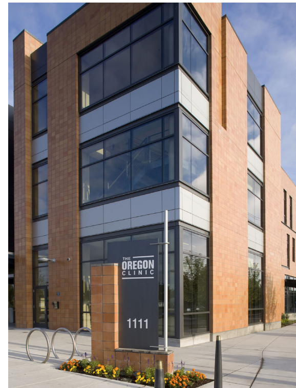
The Oregon Clinic