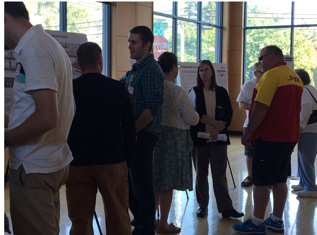
Over 70 community stakeholders attended the Gateway Action Plan Open House