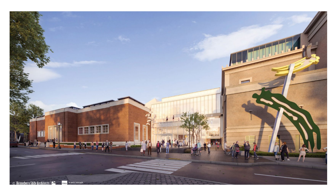
Portland Art Museum Mark Rothko Pavilion Rendering