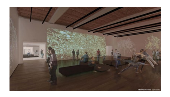
New art exhibition space