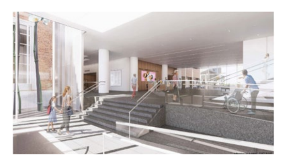
Swigert Warren Community Commons: free public space