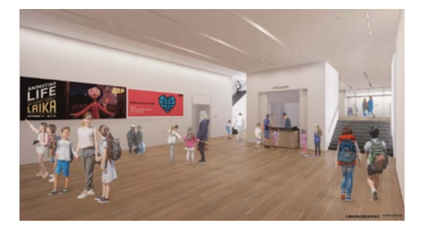
New Film & Media destination