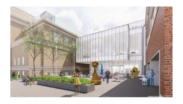
Expanded outdoor space, café, and gift shop