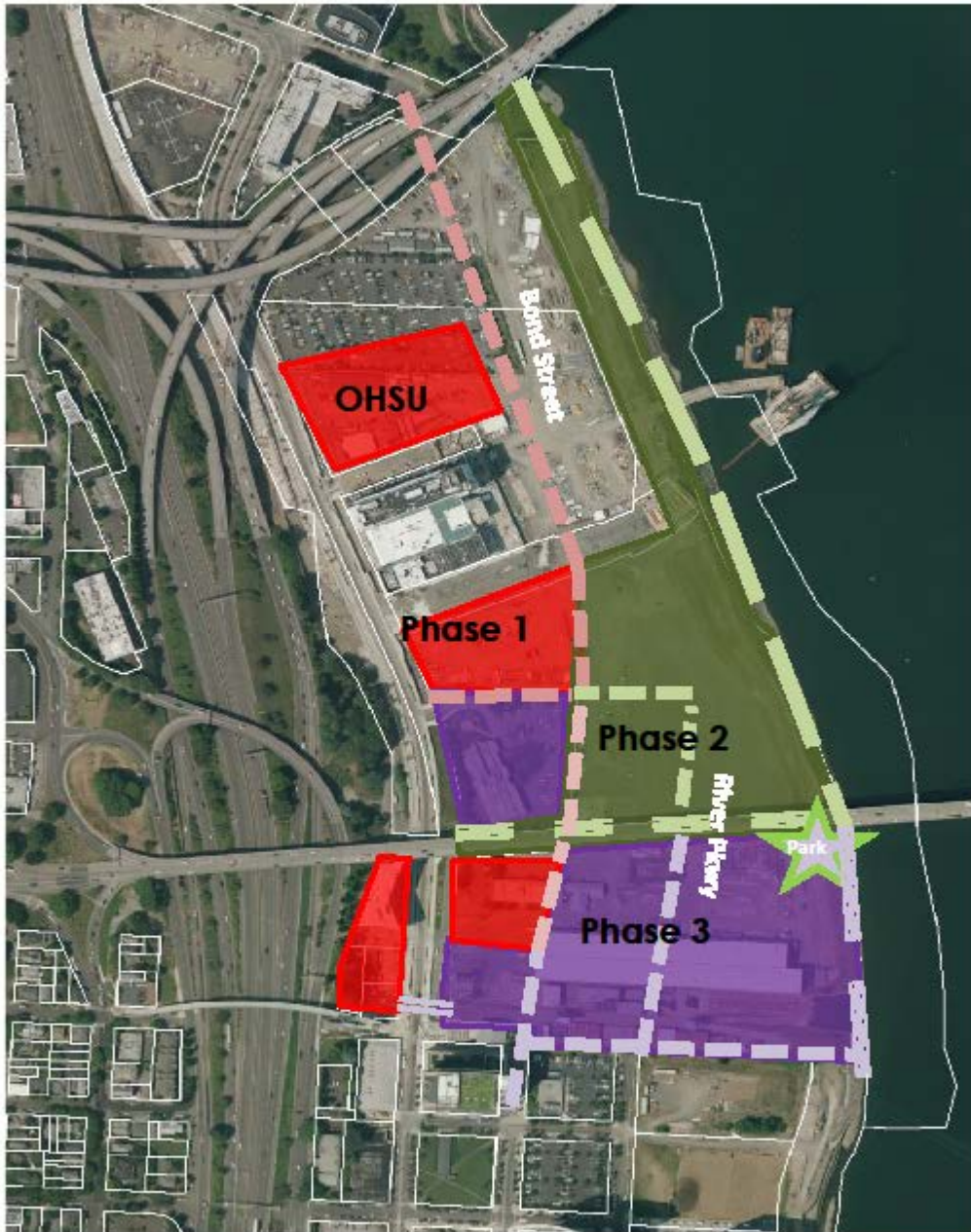
Exhibit C: ZRZ Development Agreement Phasing Plan