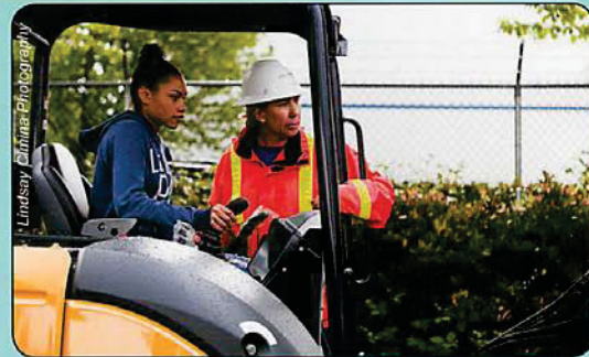
A high school girl learns to operate heavy equipment in a workshop with Goodfellow Bros.

OTI extends immense gratitude to the businesses, organizations, and individuals who support the work of OTI through participation in the annual Women in Trades Career Fair, as well as our year-round programs to encourage girls and women in their exploration of career pathways in the trades as viable and gratifying options for their futures.