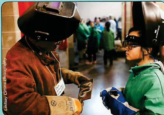
A middle school girl learns about welding techniques in a workshop with Clackamas Community College