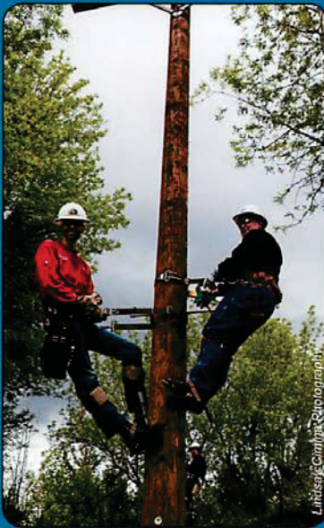
A Careers for Women Day attendee learns to climb a utility pole in Portland General Electric's workshop

A report on Oregon Tradeswomen, Inc.'s 22nd annual event that is changing the face of the next generation of tradesworkers