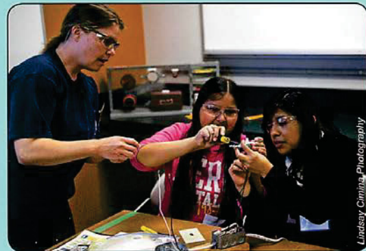
High school girls learn to wire a light and switch in a workshop with the women of NECA IBEW Local 48.