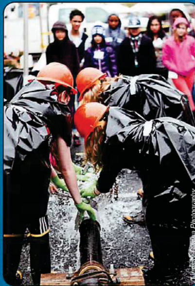
A group of middle school girls work to stop a simulated water main break in a workshop with the Portland Water Bureau