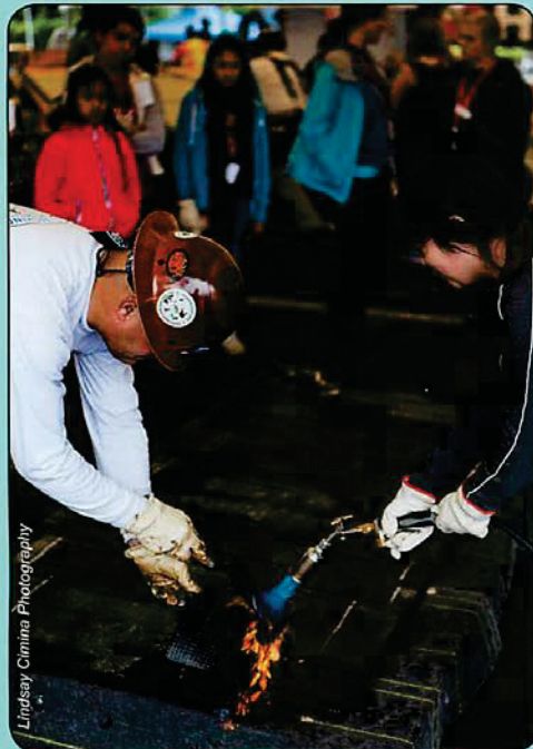
A middle school girl learns the "torch down" roofing technique in a workshop with the Oregon & SW Washington Roofers & Waterproofers